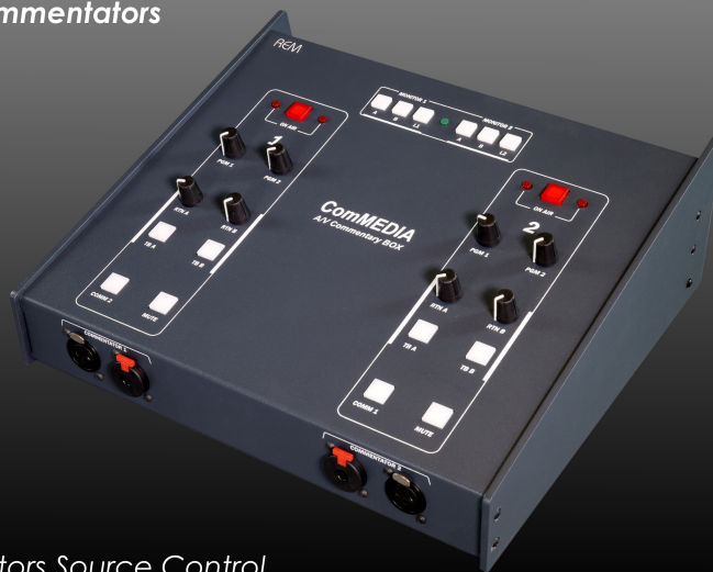
Video Monitors Source Control