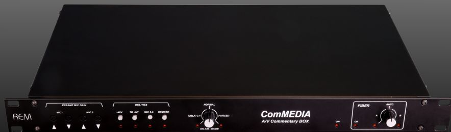
Connected to Console via Fiber Pair with Automatic Redundancy